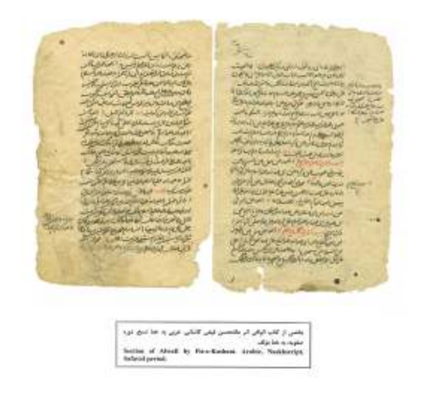
Fig 4. Two sample sheets including headings and sub-headings with a pen or color other than that of the text