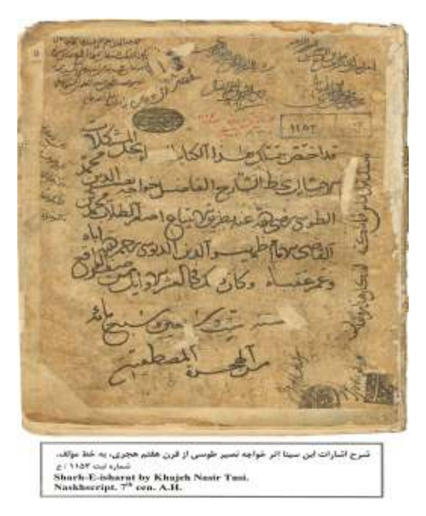
Fig 7. Two samples of "Zahrriyya notes" introducing the owners/buyers of the manuscripts