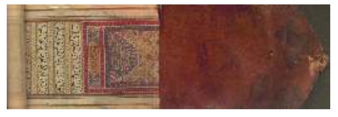
Fig. 10. Opened scroll of a manuscripts including a prayer