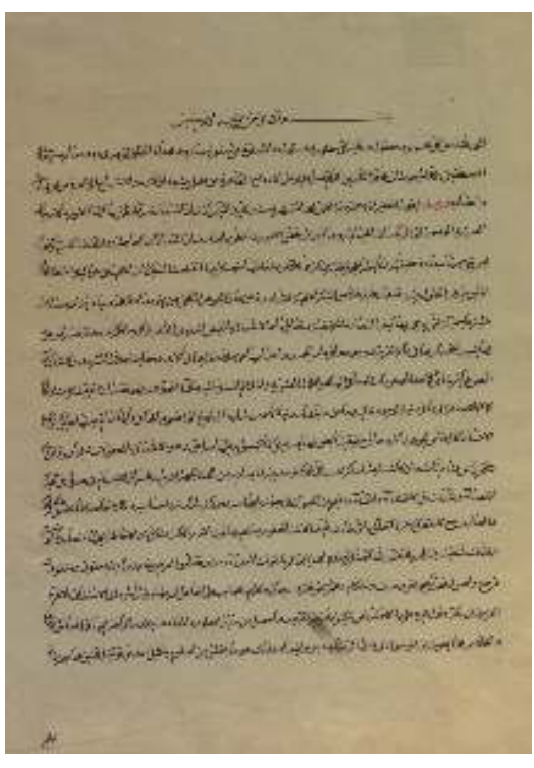
Fig. 2. A sheet including "Basmalah" and "Ḥamdalah" as well as "Ammā Ba'diyya"