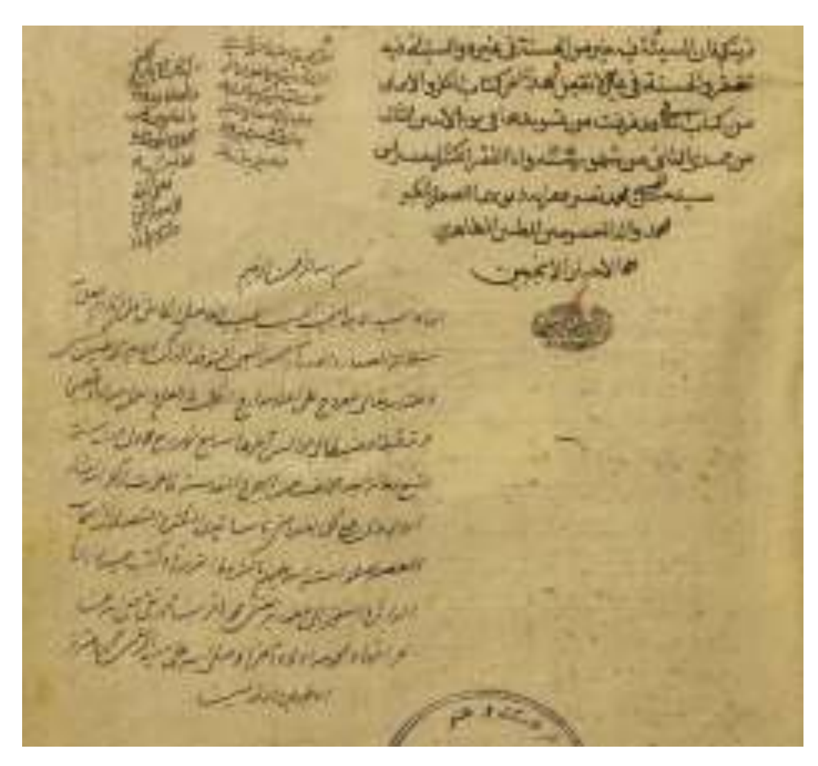
Fig. 6. The anjāma or tarqīma of a manuscript from "Kītāb al-Kāfī" ,transcribed in 1105 A.H., showing scribe name and transcription date