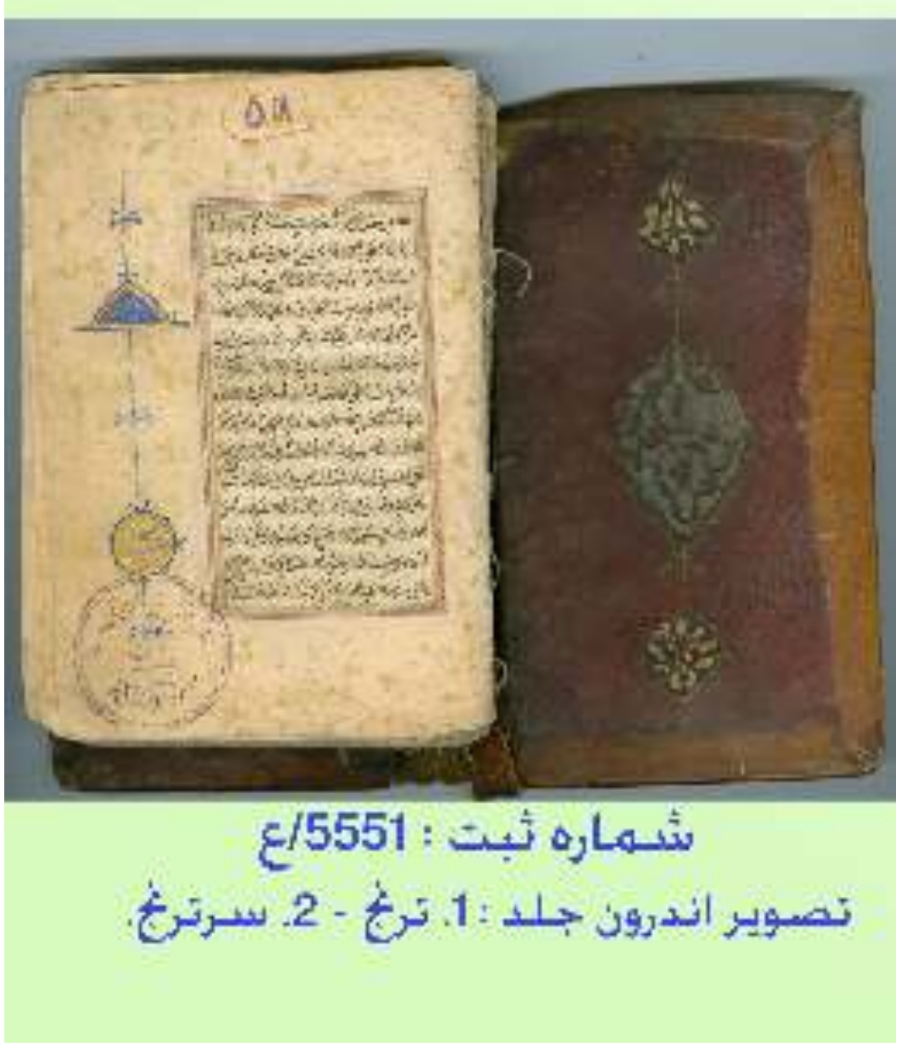
Fig. 8. Common book structure of a manuscript