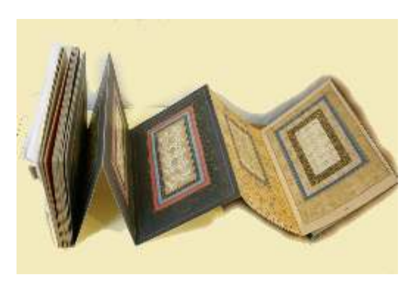
Figure 12. A "muraqqa" manuscript