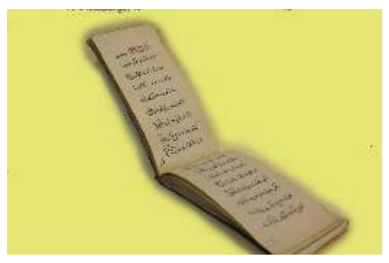
Fig 9. "Bayā d" structure of a manuscript