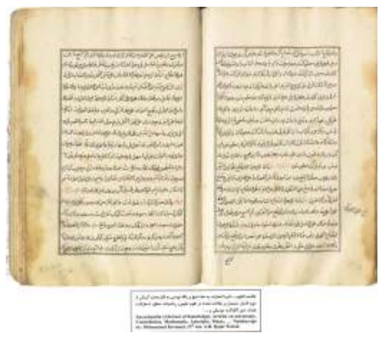
Fig 3. A sheet with "rikābe", a word at the bottom end and left side under the last line of its right page